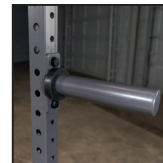
Weight Horn PPRWH