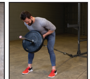
T-Bar Row PPRTB