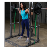
Band Pegs PPRBP