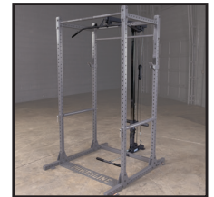
Lat Attachment PLA1000