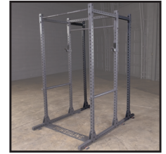
Power Rack Extension PPR1000EXT