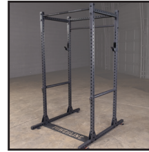
Power Rack PPR1000

Base Unit Weight: 168 lbs Base Unit Dimensions: 53.5"L x 50.9"W x 83"H